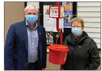
Salvation Army Kettle at Christmas