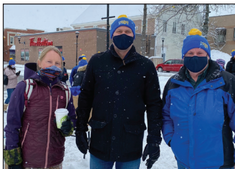
The Coldest Night of the Year