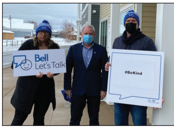
Bell "Let's Talk" Day