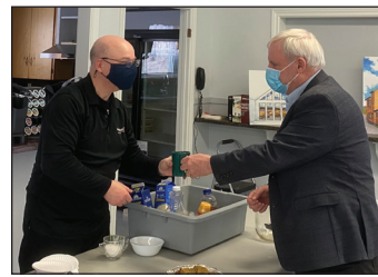
White Rock Legion